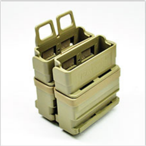
(2) FastMag Heavy (7.62) double stacked.