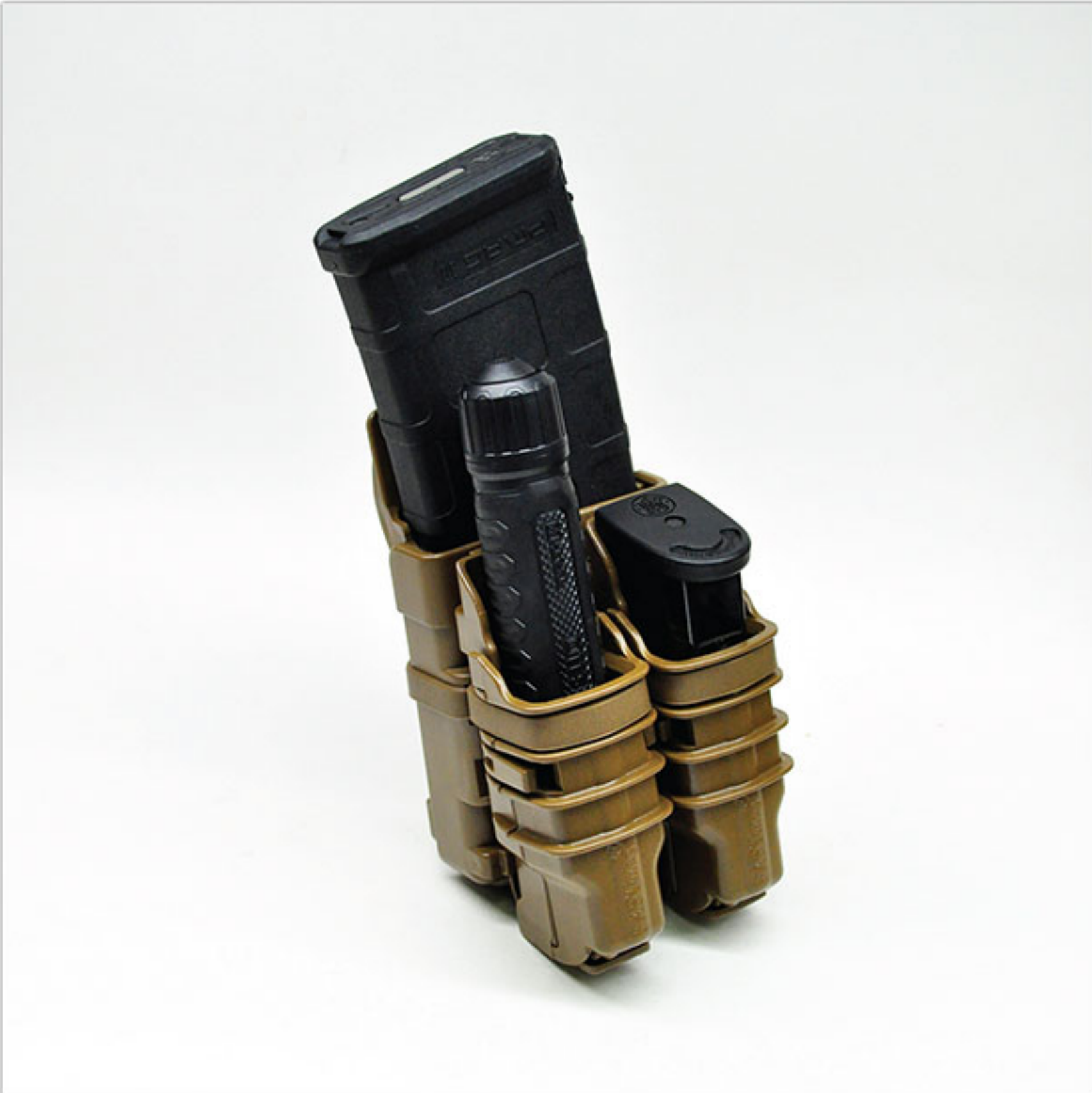
Although the ITW FastMag series is primarily used for holding most 7.62 magazines, 5.56 magazines and single/double stacked pistol magazines, the FastMag can also be used to hold other objects such as flashlights, med kits and other objects that fit its profile.