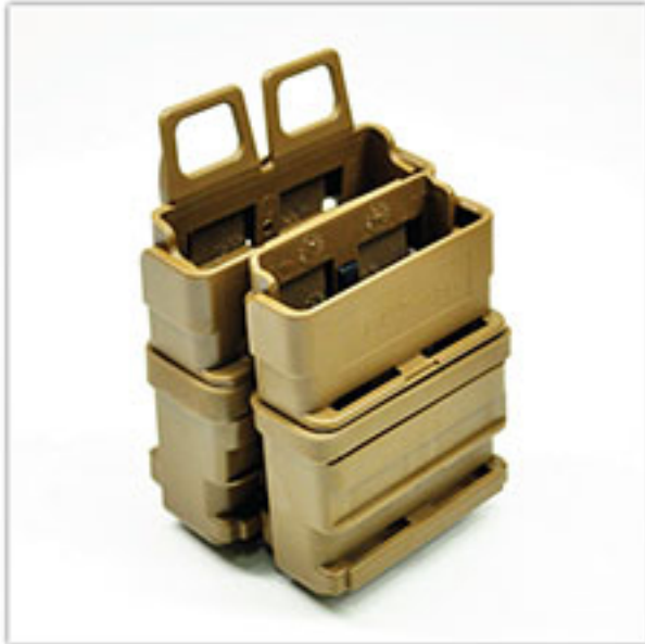
FastMag Heavy (7.62) and FastMag (5.56) double stacked.