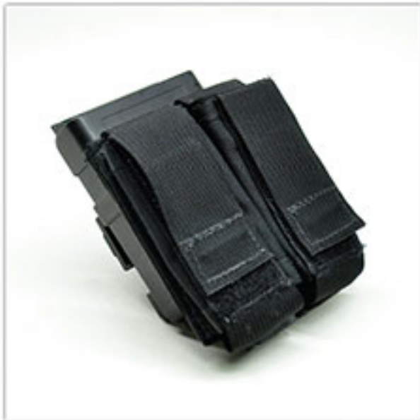
Standard nylon pistol pouch mounted to FastMag Heavy (7.62) (or) FastMag (5.56) with MALICE® clips.