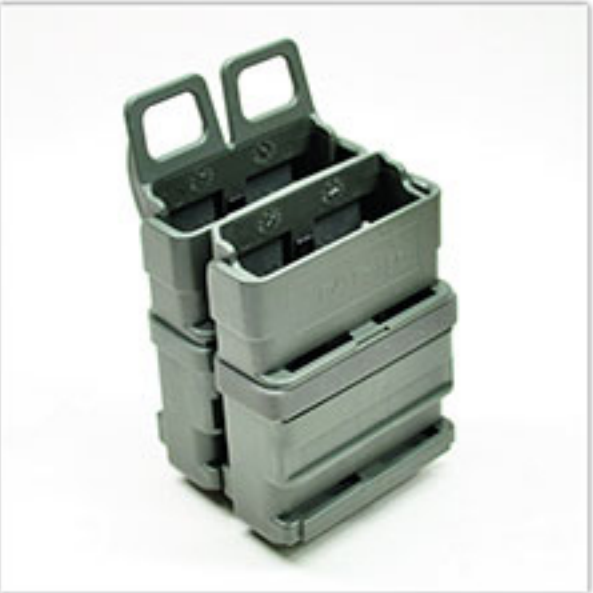
(2) FastMag (5.56) double stacked.