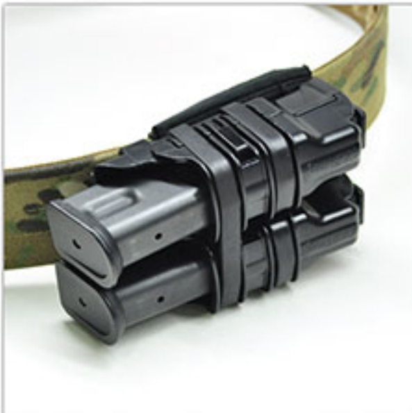
(2) FastMag Pistol on custom horizontal nylon mount for duty belt.