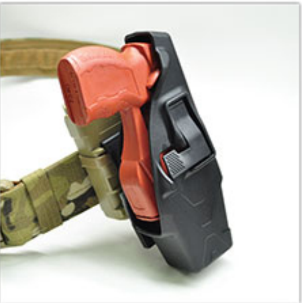
Taser holster mounted to FastMag Heavy (7.62) (or) FastMag (5.56) with MALICE® clips.