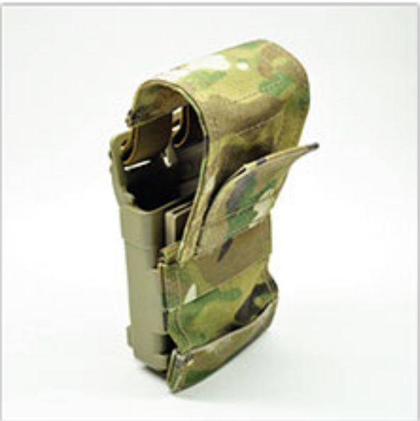
Custom nylon applications mounted to FastMag Heavy (7.62) (or) FastMag (5.56) with MALICE® clips.