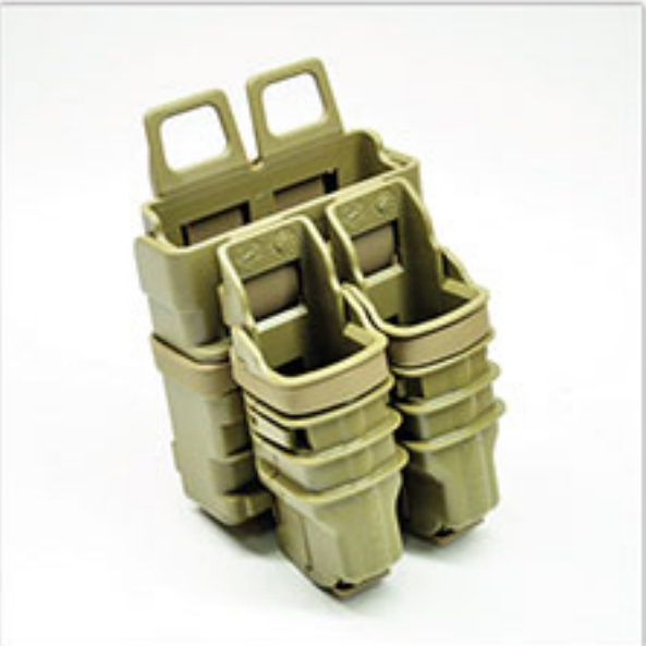
FastMag Heavy (7.62) with (2) FastMag Pistol stacked.