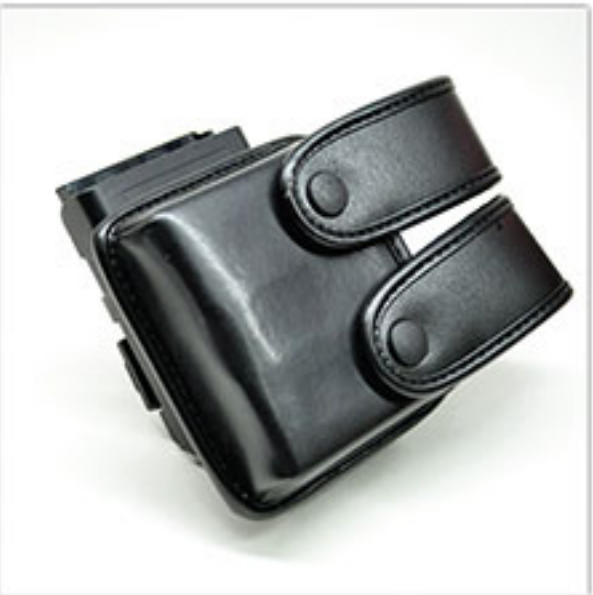
Standard leather LE pistol patrol pouch mounted to FastMag Heavy (7.62) (or) FastMag (5.56) with MALICE® clips.