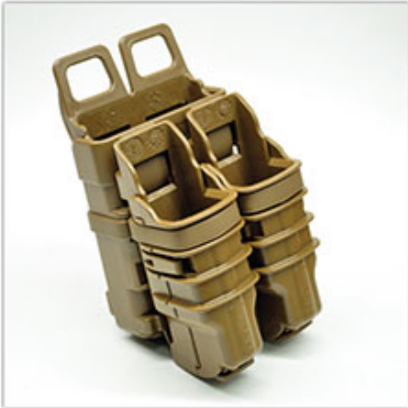
FastMag (5.56) with (2) FastMag Pistol stacked.